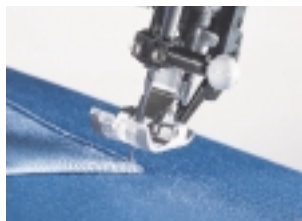
"Needle up/down" function! The needle remains in the down position while the presser foot is automatically raised, for easy pivoting in any thickness of fabric. This function is also available through the foot control!